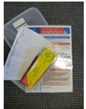
Example of student's anaphylaxis emergency kit