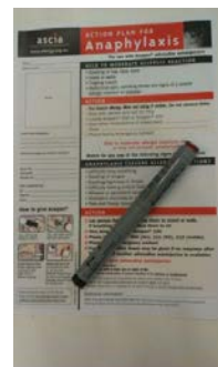
Action Plan for Anapen®

There are a number of different Action Plan templates which are colour coded to indicate the severity of the allergic reaction and the type of medication or adrenaline auto-injector the patient may use.