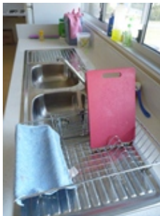
Clean chopping boards before and between use