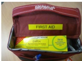
Example of school first aid kit