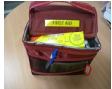
Example of school first aid