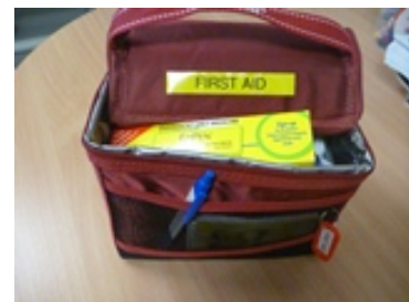
Example of school first aid kit