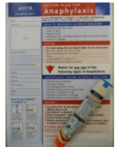
Action Plan for EpiPen®

A student with diagnosed anaphylaxis or mild to moderate allergic reactions should have an Action Plan completed by their medical practitioner. Action Plans are standardised templates developed by the Australasian Society of Clinical Immunology and Allergy (ASCIA), available on their website and detail how to manage a patient's allergic reaction should it occur.