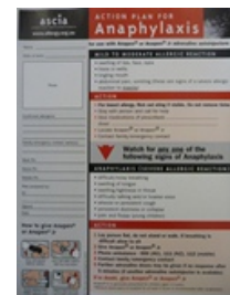
Example of student Action Plan (template)