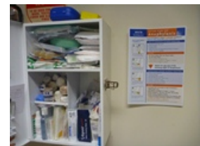
First aid kit containing auto-injector with Action Plan (general) displayed