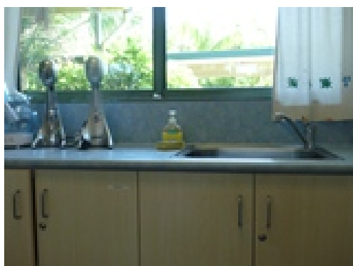
Keep surfaces clean