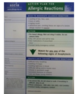
Action Plan for Allergic Reactions